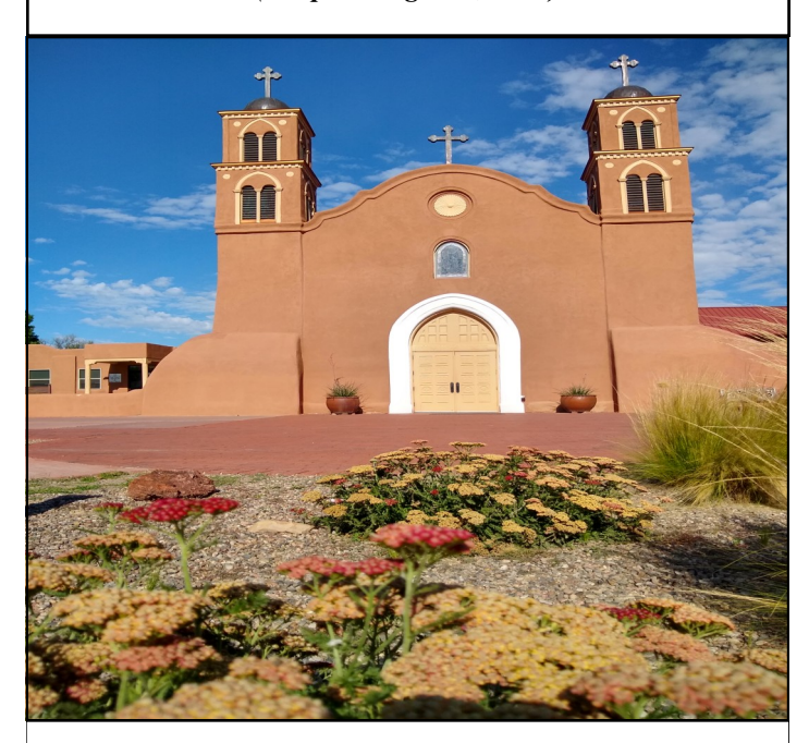
Parish Vision Statement

We Strive to Bring People Closer to God." (Adopted August 5, 2008)