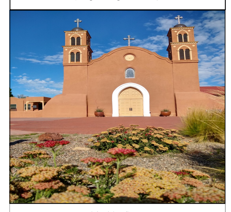
Parish Vision Statement

We Strive to Bring People Closer to God." (Adopted August 5, 2008)