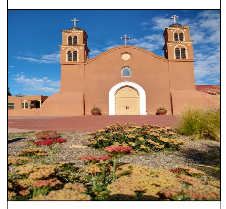
Parish Vision Statement

We Strive to Bring People Closer to God." (Adopted August 5, 2008)