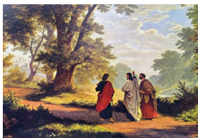
The Road To Emmaus

San Lorenzo, Polvadera: December 12th @ 7pm